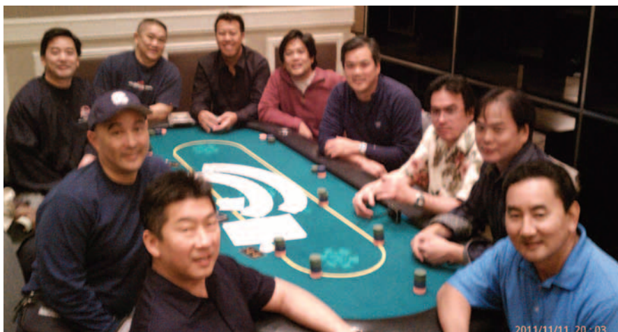
Members of the Class of '85 enjoyed an "Off-Year Reunion."