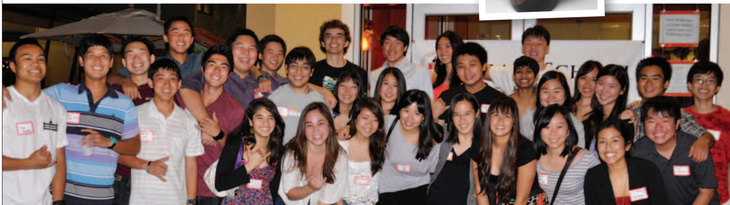
Members of the Class of 2011 attended their first 'Iolani alumni reception during the recent holidays.