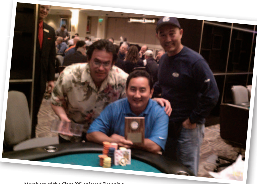
Members of the Class '85 enjoyed "keeping the Nevada economy going."