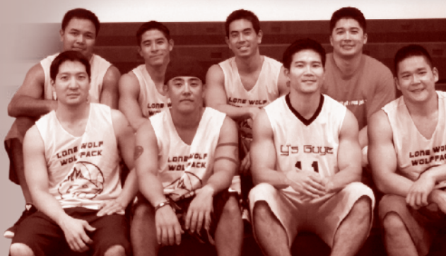
Members of the Class of '98 won the championship game of the summer league.

Congratulations go to all three division champions and to all 23 teams for a fun and successful alumni league. Pictured is the Class of '98 team.