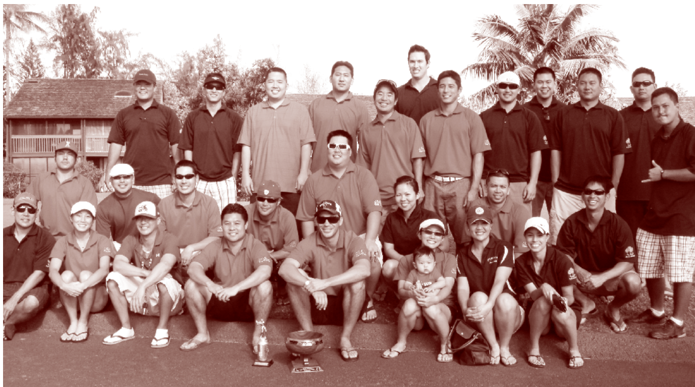
Each summer, alumni from 'Iolani and Punahou schools gather for a friendly golf game and good old fashioned rivalry.