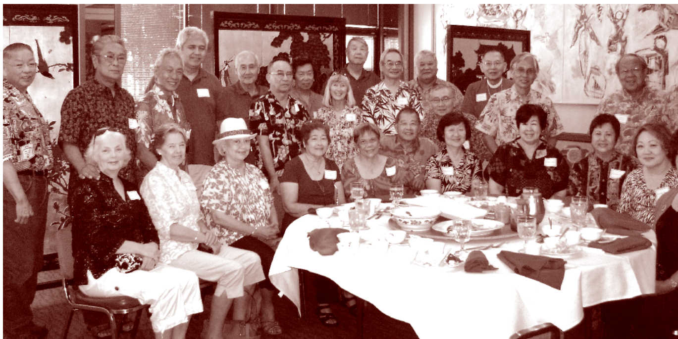
The Class of 1959 enjoyed a recent luncheon at Hee Hing restaurant.