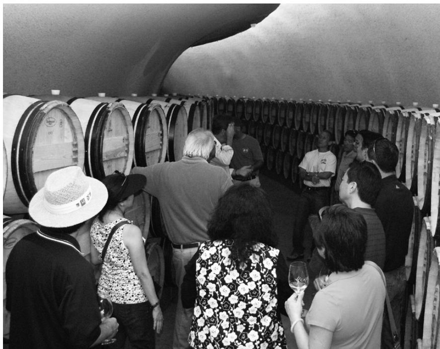
The Class of '74 also toured the caves of the Cade Winery in the town of Angwin.