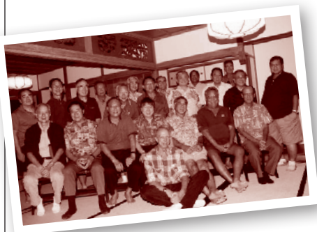
Twenty-two classmates from the Class of 1961 enjoyed a 47th-year reunion at Natsunoya Tea House.