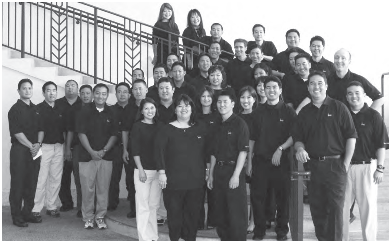
The Class of '90 organized a successful 2009 A Touch of 'Iolani.

The Class of 1990 did a fabulous job hosting A Touch of 'Iolani this year. Here is a shout out to all the classmates who made the event an amazing success! It was an amazing time seeing old friends working hard, laughing, and enjoying the delicious food.