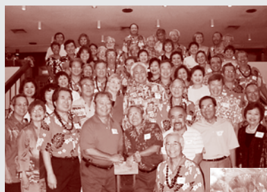
The Class of '58 celebrated their 50 th year reunion with several activities.