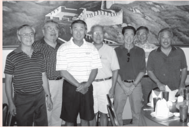
Even though the painting in the background may look like it, these members of the Class of '65 did not go to the Beijing